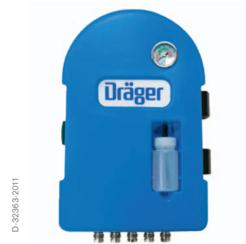
Dräger PAS® Filter - wall-mounted