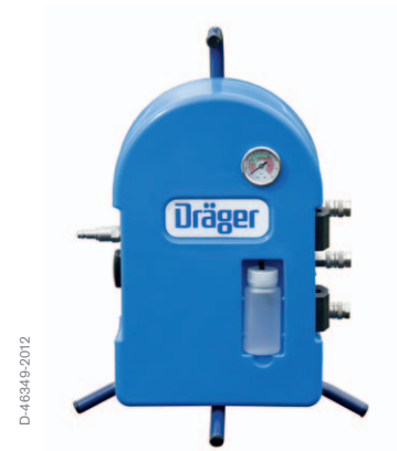
Dräger PAS® Filter - portable