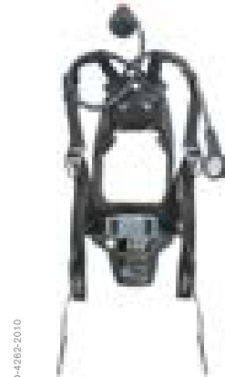
Dräger PAS® Lite

Incorporating new materials that are shaped and formed to provide maximum comfort at both the shoulders and the waist, the carrying system has been developed to reduce back strain, stress and fatigue. The innovative harness design ensures an excellent weight distribution at the shoulders. The inclusion of durable rubber coated fabric provides excellent wearing comfort and chemical resistance, whilst also performing well during the flame engulfment test in line with EN137 Type 2.