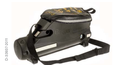
Dräger Saver CF – hard case