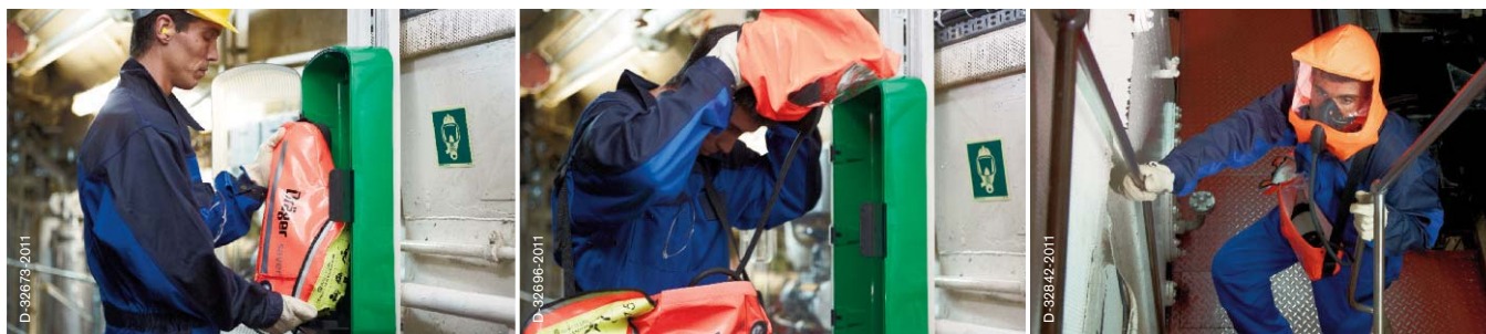
Dräger Saver CF soft bag