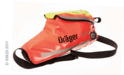
Dräger Saver CF – soft bag

The SE version includes a newly developed elastic neck seal which offers unparalleled resistance to the effects of high temperatures, ozone and diesel fumes, which are often found in places such as engine rooms. This translates to years of reliable, worry-free service, even under adverse conditions. Standard Dräger Saver CF15 units can also be retrofitted with the SE option.