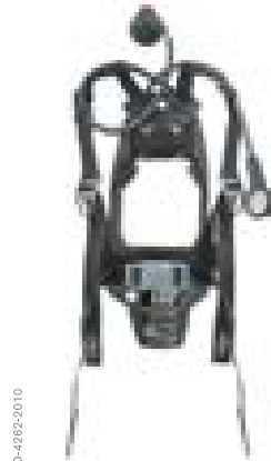
Dräger PAS® Lite

Incorporating new materials that are shaped and formed to provide maximum comfort at both the shoulders and the waist, the carrying system has been developed to reduce back strain, stress and fatigue. The innovative harness design ensures an excellent weight distribution at the shoulders. The inclusion of durable rubber coated fabric provides excellent wearing comfort and chemical resistance, whilst also performing well during the flame engulfment test in line with EN137 Type 2.