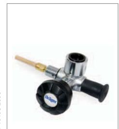
300 bar in-line valve with integrated gauge With flame retardant hand wheel.