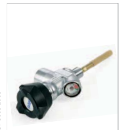
200 bar in-line valve With flame retardant hand wheel.