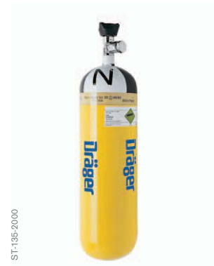
Valved carbon composite cylinder

Every batch of 200 cylinders is subjected to exhaustive testing in accordance with the legislative design and manufacturing codes (EN 12245 and 97/23/EC), under the supervision of a Notified Body. All relevant production data is retained electronically for the full working life of the cylinder.