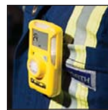
Easy To Wear