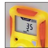
Easy to See