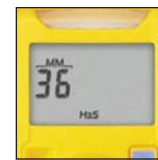
Easy to Read