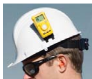
Hard Hat Clip