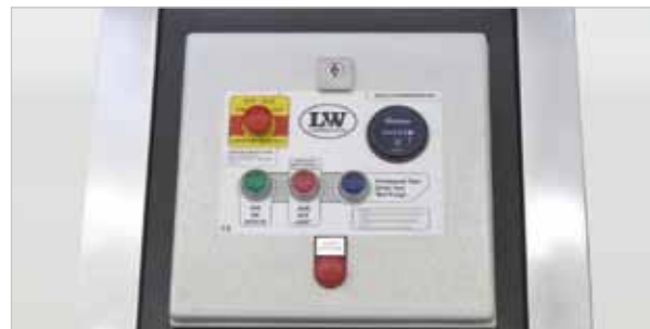
Control panel c/w options