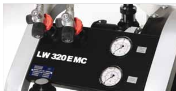
Filling pressure gauge c/w options