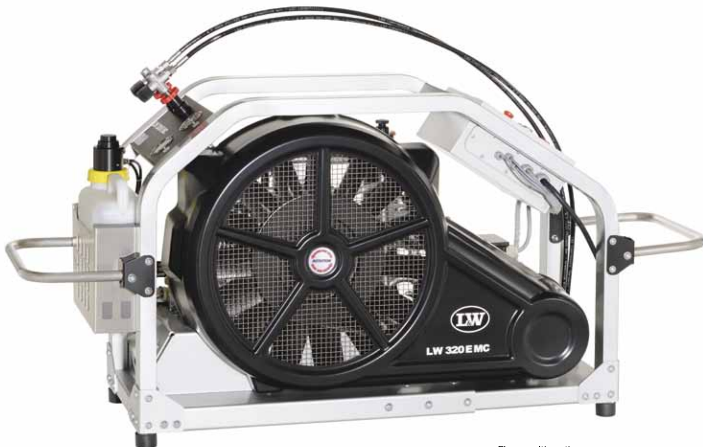
Figure with options

Depending on the motor size they are fully equipped with either direct- or star /delta start systems. A super lightweight aluminum frame enables mobile applications, combined with very high filling capacity. The robust and powerful compressor block also allows being used at fully automatic stationary plants.