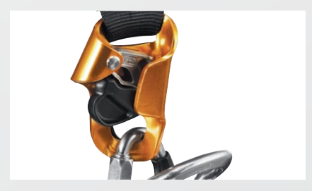
Integrated CROLL ventral rope clamp. The shoulder-strap/waistbelt connector is equipped with a captive bar to inhibit connector rotation.