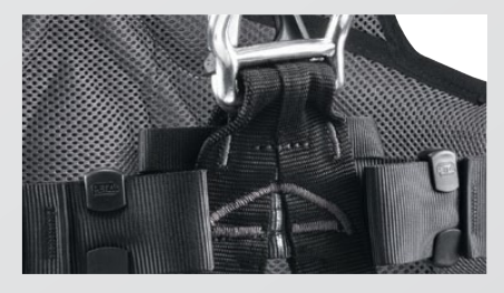
Two attachment points allow a PODIUM seat to be attached, for greater comfort during prolonged suspension.