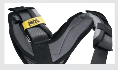
Shoulder straps with self-locking DoubleBack buckles for easier harness adjustment.