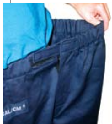
Elastic waistband for maximum comfort.