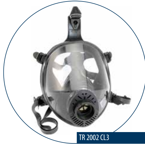
TR 2002 CL3