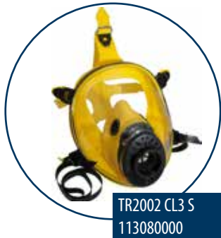
TR2002 CL3 S 113080000

Strap around the neck for carrying the mask during rests