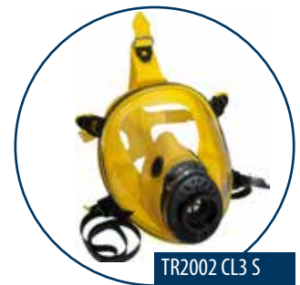
TR2002 CL3 S