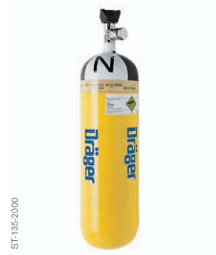
Valved carbon composite cylinder

Every batch of 200 cylinders is subjected to exhaustive testing in accordance with the legislative design and manufacturing codes (EN 12245 and 97/23/EC), under the supervision of a Notified Body. All relevant production data is retained electronically for the full working life of the cylinder.