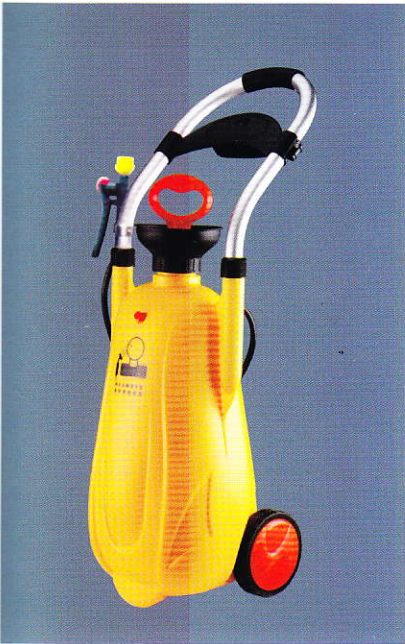
WJH0782A 便携式压力冲肤/洗眼器 Portable Press-wash Skin & Eye Wash