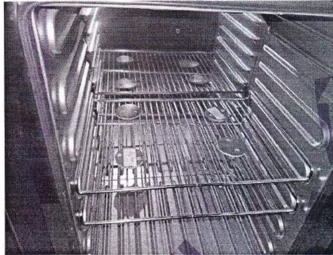
Figure 5: EUT before the ageing test