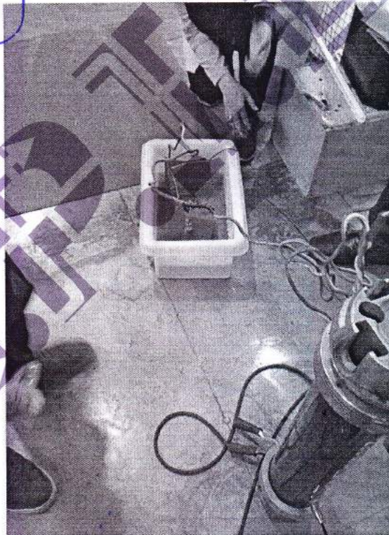
Figure 4: EUT before the withstand test

EPIL ✓ Technical Department ISO IEC 17025 Accredited Lab