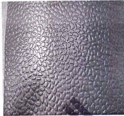
Figure 1: EUT