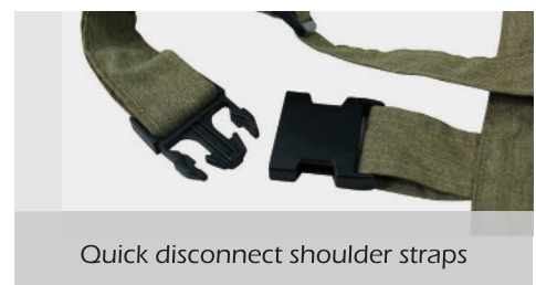
Quick disconnect shoulder straps