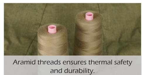
Aramid threads ensures thermal safety and durability.

Fabric specification : 380 g/m 2 Inherent Fabric