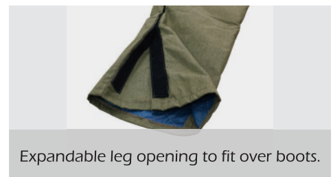
Expandable leg opening to fit over boots.